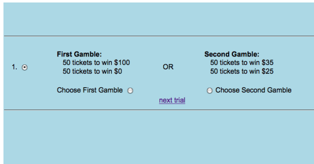
Figure 1: The appearance of one choice trial.

of these lucky people, you will get to play the gamble you chose on the trial selected. You might win as much as $100. Any one of the choices might be the one you get to play, so choose carefully.” After each study, prizes were awarded as promised.